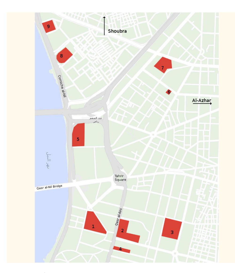
Figure 1: Map of Downtown Cairo

1 US Embassy, 2 Parliament, 3 Ministry of Interior, 4 Ministerial Cabinet, 5 NDP Headquarters, 6 Journalists Syndicate, 7 Supreme Court, 8 Maspero Television Building, 9 Ministry of Foreign Affairs